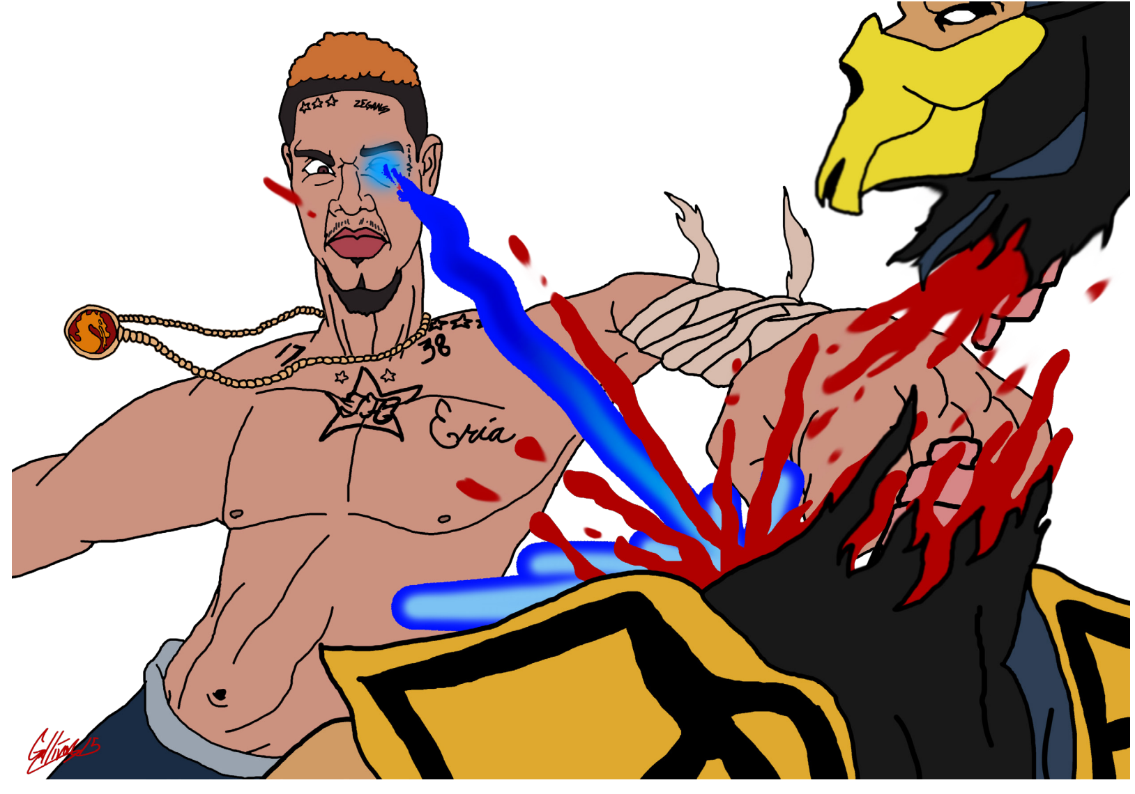
ILLUSTRATION BY: EDWARD GALLIVAN/ SPECIAL TO THE LEADER