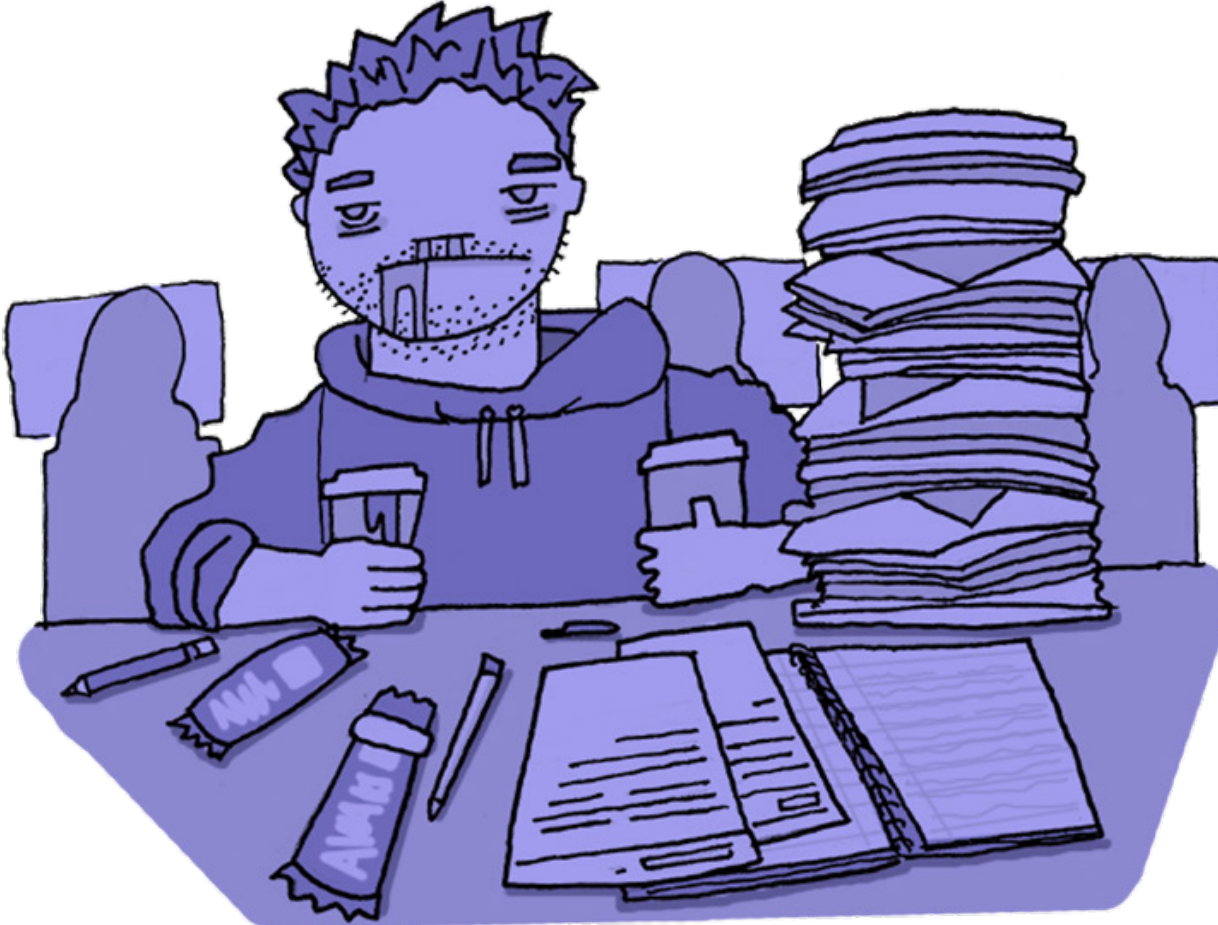
ILLUSTRATION BY: JACK WEAVER/ SPECIAL TO THE LEADER

Tips for surviving the end of the semester