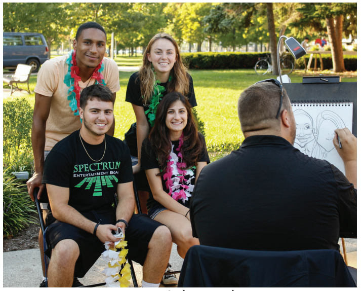
Students enjoy luau party.

All of the groups are looking for new members and encouraged anyone with a passion for singing to stop by their tables during Activities Night on Aug. 31 from 6:30 p.m. to 8 p.m.