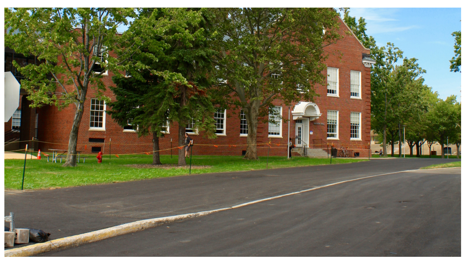
A view of where the bridge was near Mason Hall