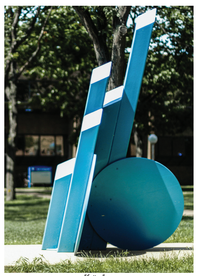
"Cutter."