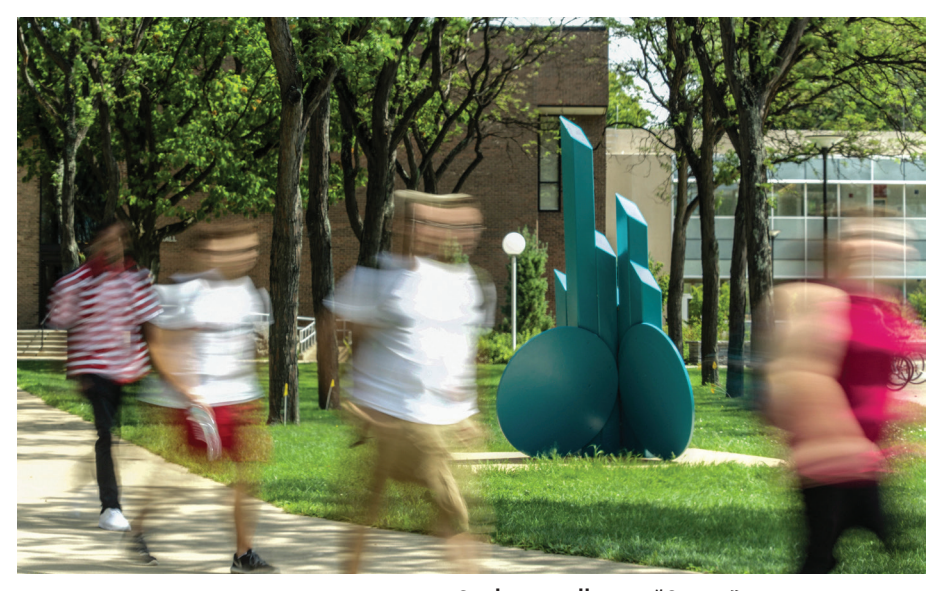
Students walk past "Cutter."