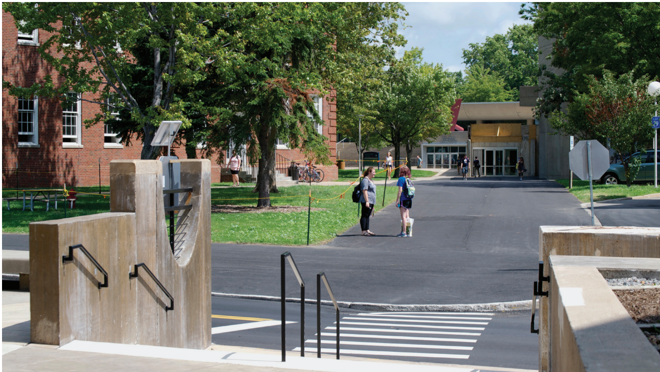
Former bridge area as seen from the Williams Center.