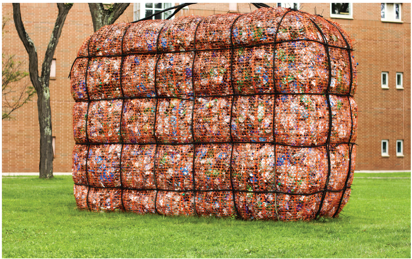
"Suitcase."