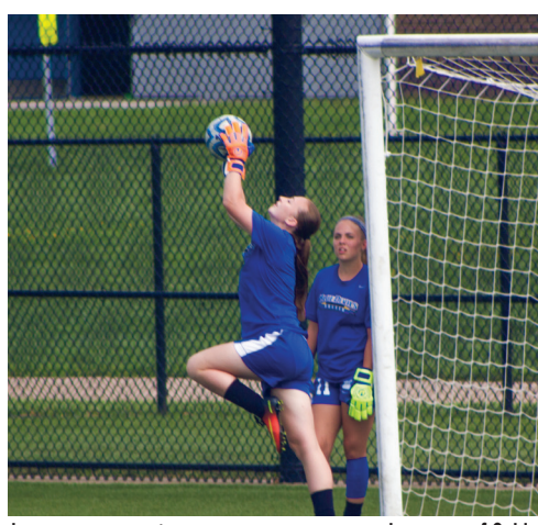
The varsity women's soccer team practices on the astroturf field.