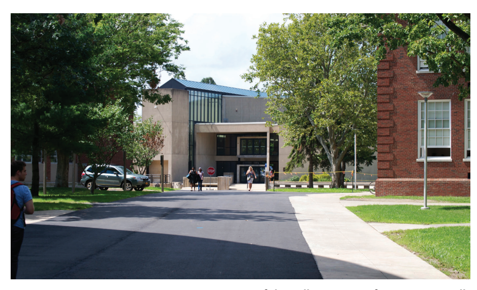
New view of the Williams Center from McEwen Hall