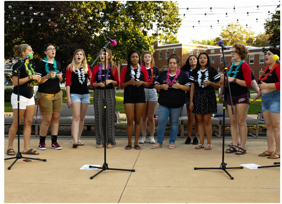
Some Like It Hot performs at Spectrums Luau Party