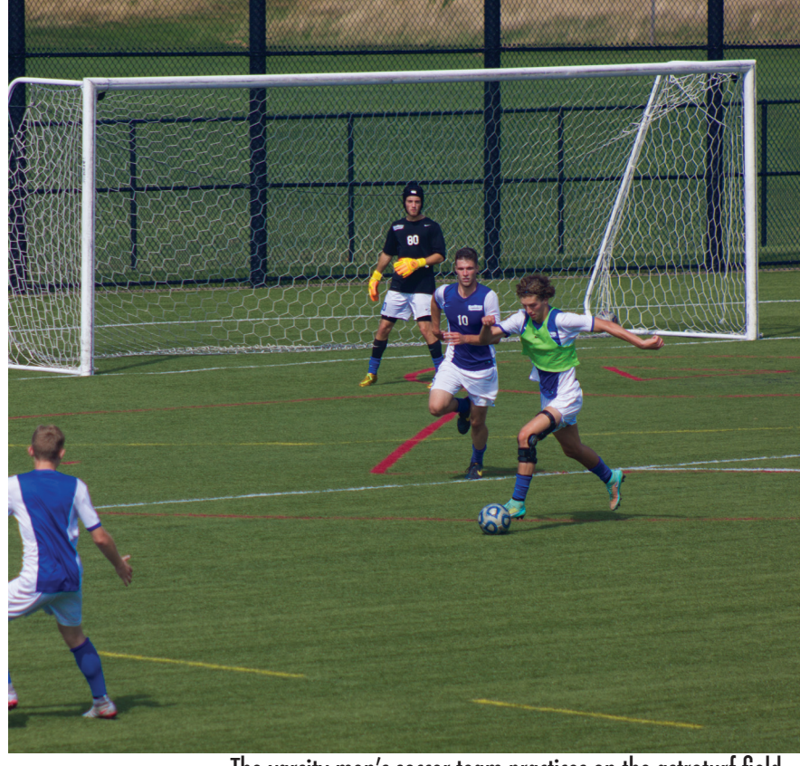
The varsity men's soccer team practices on the astroturf field