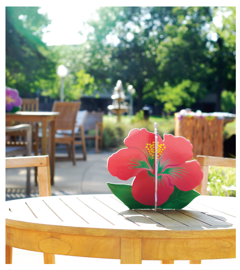
Place setting at Spectrum's Luau party