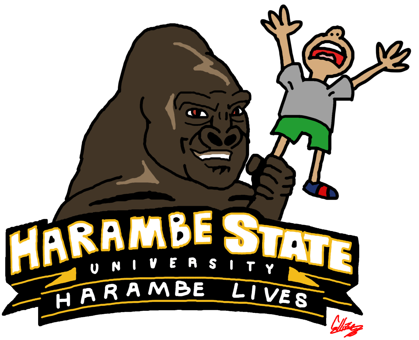
Illustration courtesy of Edward Gallivan/Staff Illustrator

Sports teams to be addressed as the Harambe State Harambes