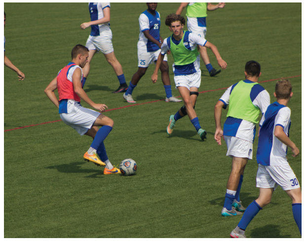
The varsity men's soccer team practices on the astroturf field.

Fredonia will open up the season at U.S. Merchant Marine in Baltimore on Sept. 3. The first home game of the season will be against Houghton College on Sept. 9 at 6 p.m.