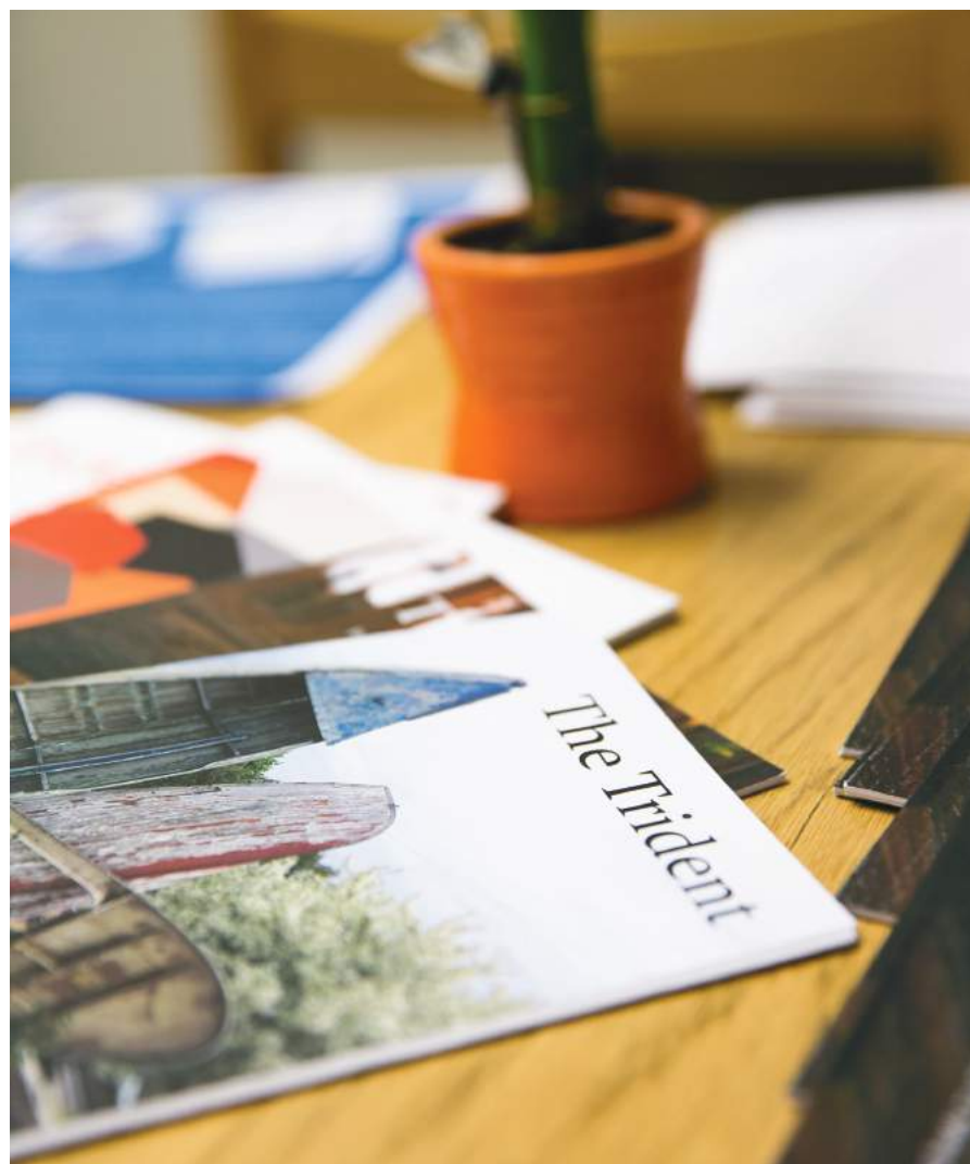
A past issue of The Trident displayed in the English Department office.