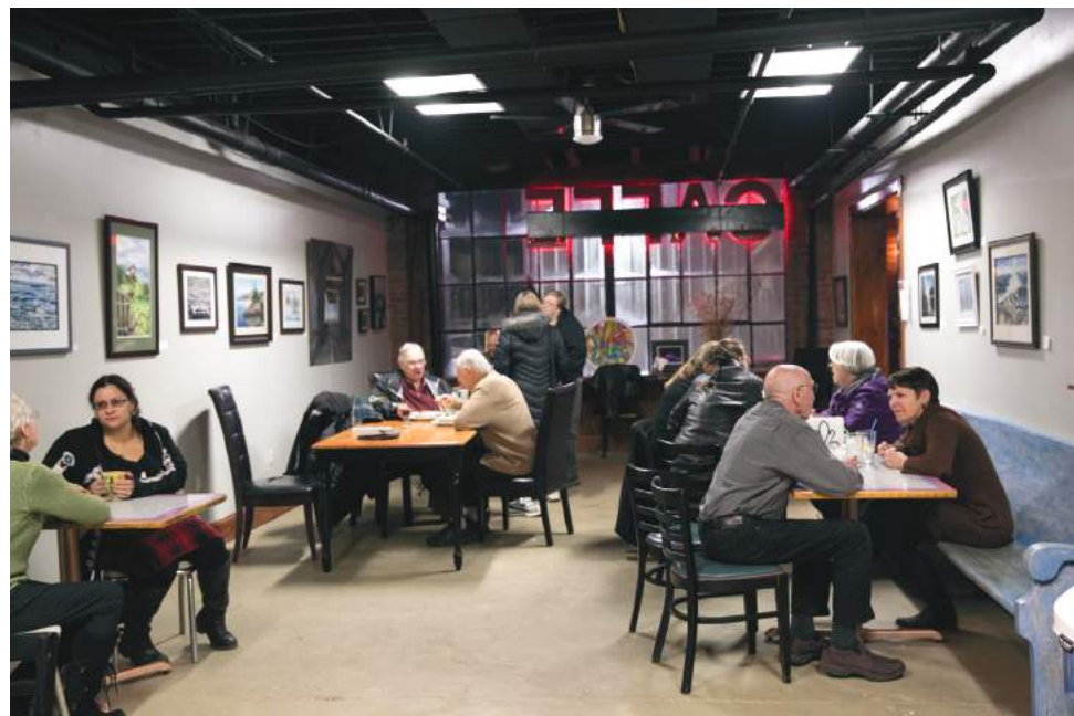
The "Escapes" art installation at Kasia Coffee.