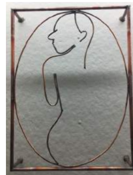
Untitled by Autumn Fitzpatrick on display in Rockefeller Arts Center. Courtesy of Autumn Fitzpatrick.

"I have been to an organization workshop on campus along with a résumé workshop, and they were both very helpful," she said.