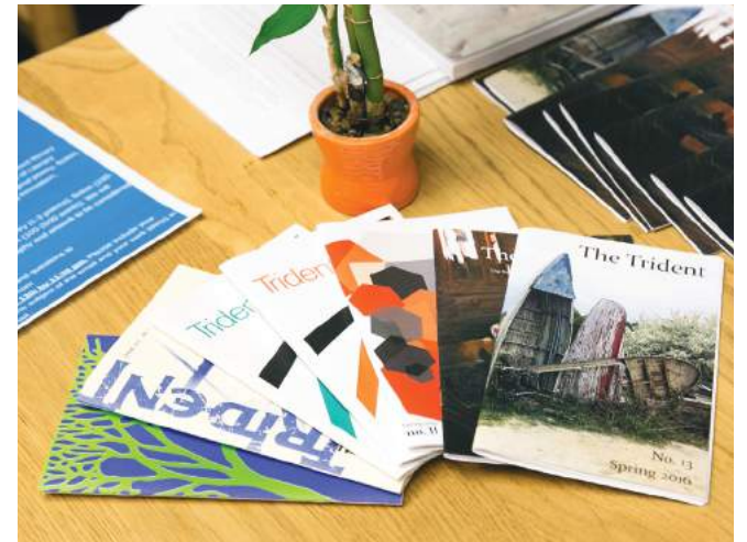
Previous editions of literary magazine The Trident.