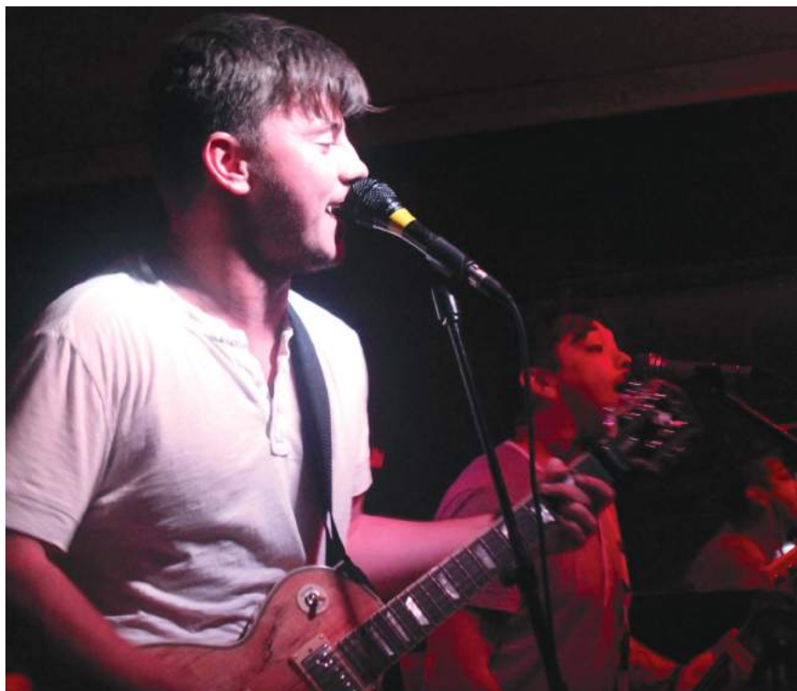
Super American performs at BJ's.