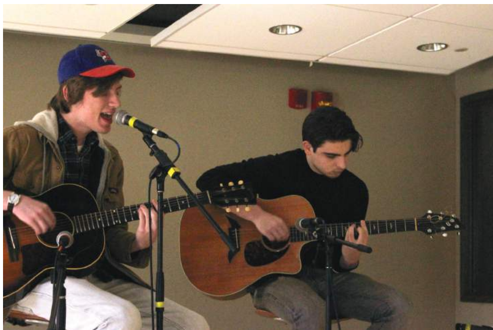
Members of Johnny and The Man Kids jam with one another.