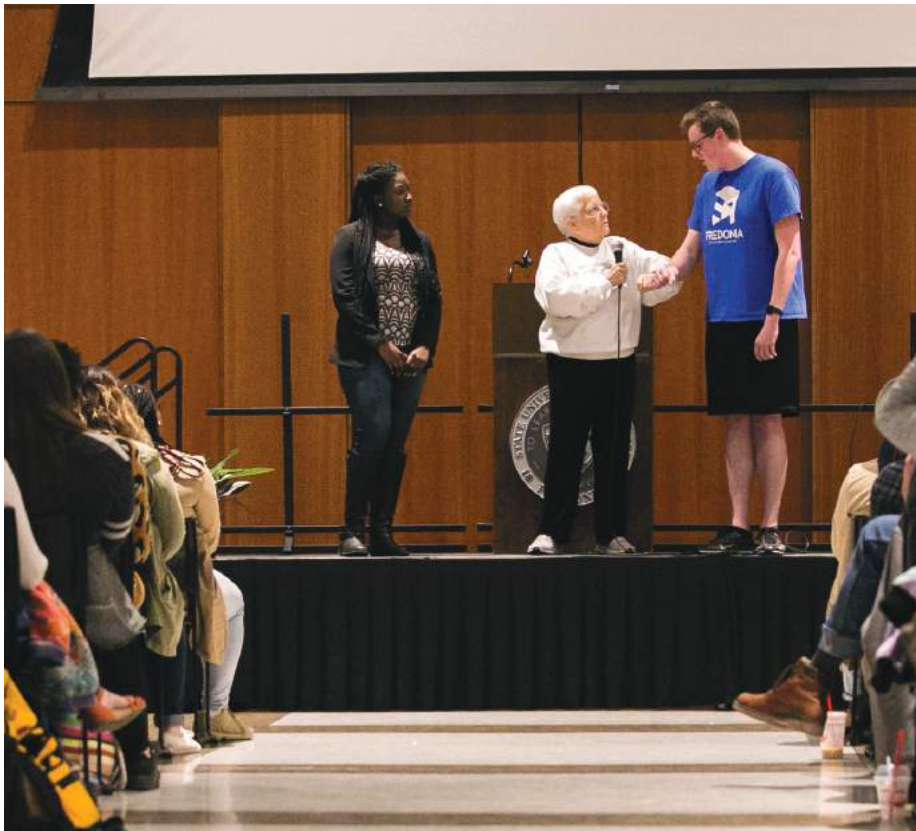
Jane Elliott lectures.