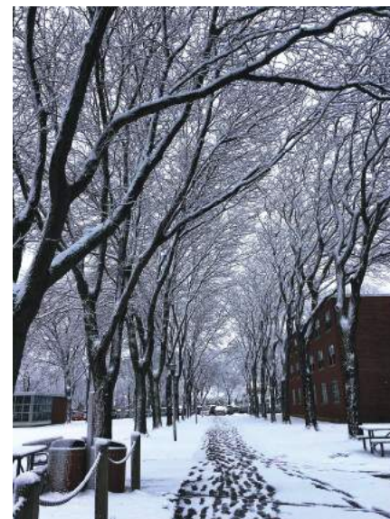
On the cover: Snowy scene between Nixon and Chautauqua Halls.