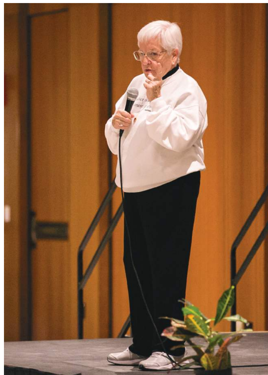
Jane Elliott lectures in the MPR.