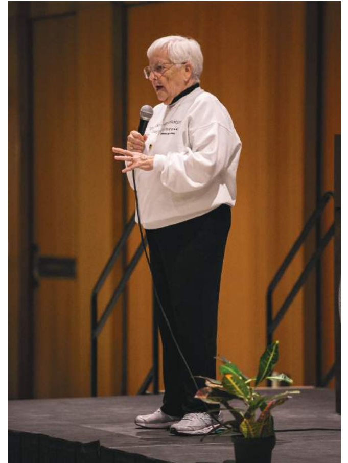
Jane Elliott addresses a crowd in the MPR.

Elliott received a grand applause at the end of both the afternoon workshop and evening lecture. Her message about combating racism electrified many who had the opportunity to hear her speak.