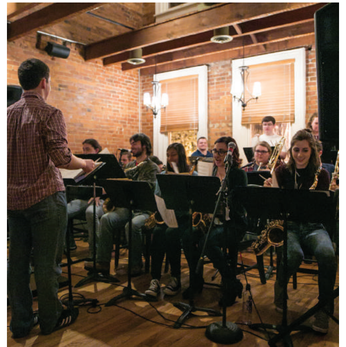
Fredonia Big Band opens up the jazz concert held at EBC on Friday, April 21.

If you want to get your jazz on, keep your eyes posted for upcoming performances next semester.