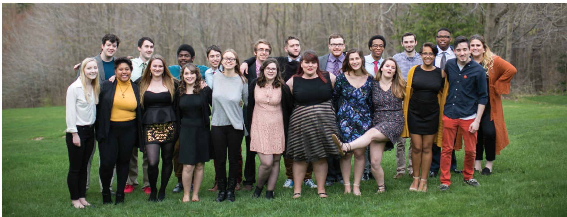
Members of The Leader pose at the second annual Campus Media Banquet at the College Lodge on April 21.