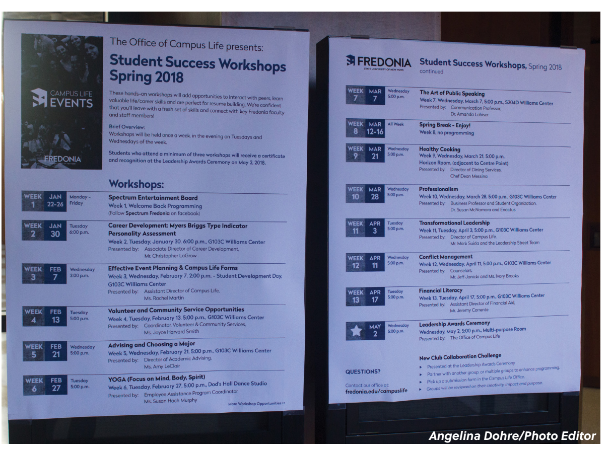
A list of upcoming Student Success Workshops is currently on display in the Williams Center.

"Basically, I gave Campus Life a student perspective on what workshop topics I think students would find most interesting," she said. "How to appeal to students, how often students would most likely be willing to come to these workshops, which locations would work best and what clubs or faculty members should execute the workshops to gain the most student interest."