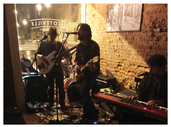
The band Mosswalk performed at EBC West late Saturday night.