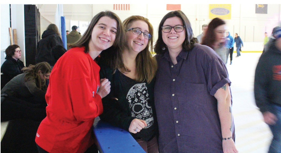
(T&B) Fredonia Radio Systems hosted the 2018 Rock N' Skate at Steele Hall Ice Rink.