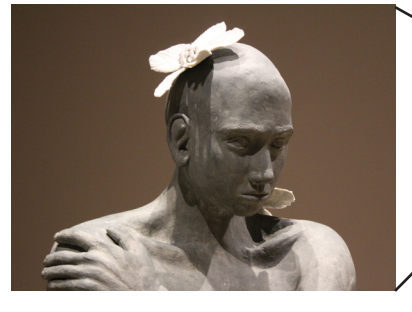
A sculpture about identity by Collin Hassler