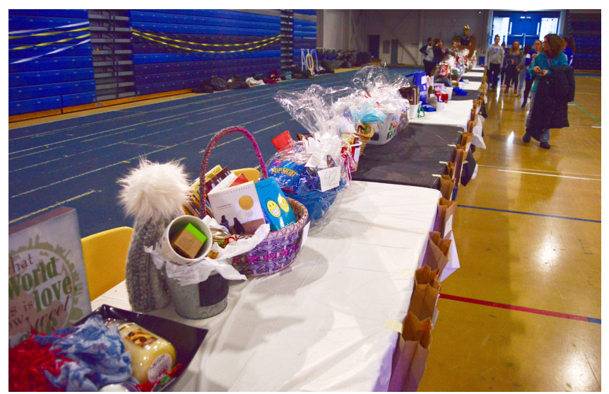
A variety of prizes donated by various clubs await raffle winners