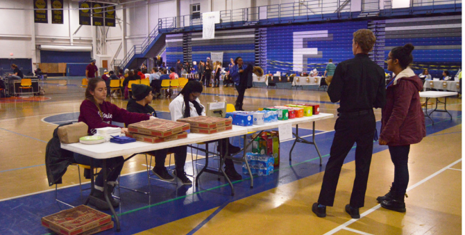
(A): The Tree of Life Benefit attendees sit as they wait for the next performance(R): The Tree of Life banner is set up for pictures