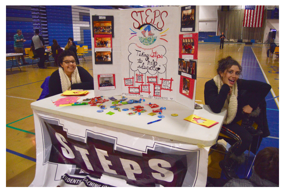
The STEPS table is all set up with free candy and condoms