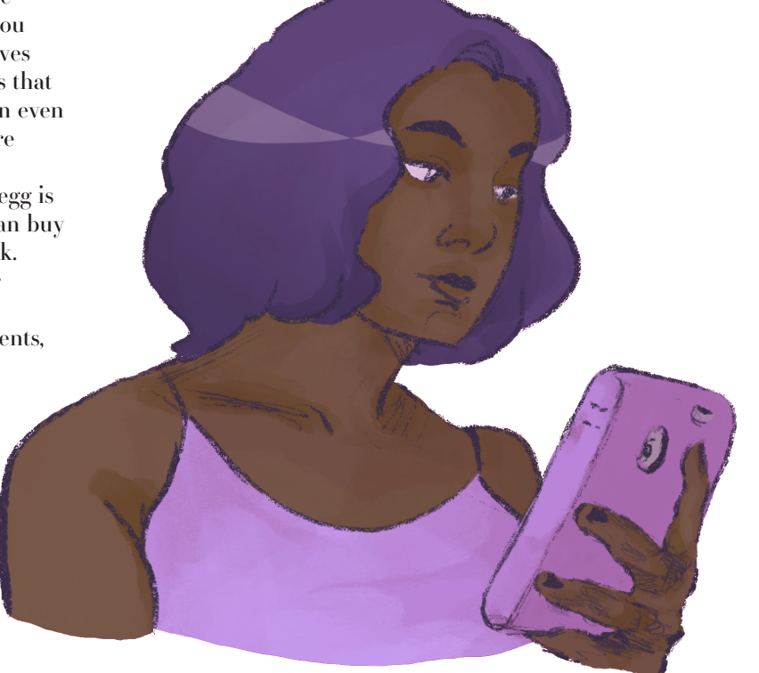
Alissa Salem/Staff Illustrator

"StudyBlue" can be found for free download on iTunes and the Google Play store.