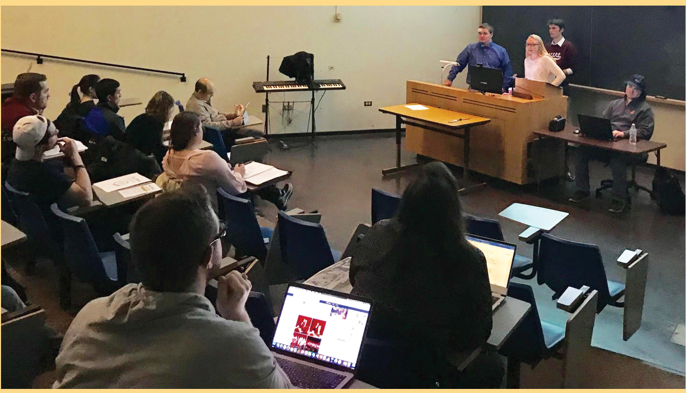
Class representatives debate increasing SA executive stipends at General Assembly on Dec. 6