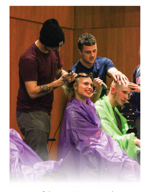
Some of the participants in the event