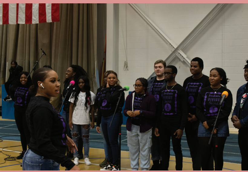
Divine Sound performs, along with several other a cappella groups.