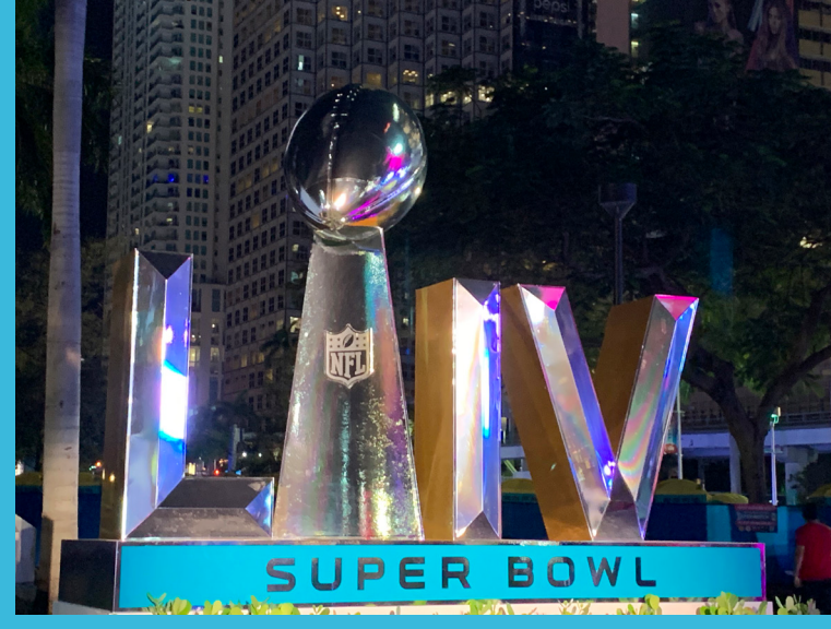
Entrance to Hard Rock stadium.

Super Bowl LIV monument in Miami, FL.