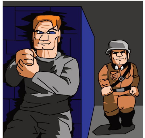
Daniel Salazar/ Staff Illustrator

"Wolfenstein: The New Perspective" is slated to release on Sept. 2, 2017.